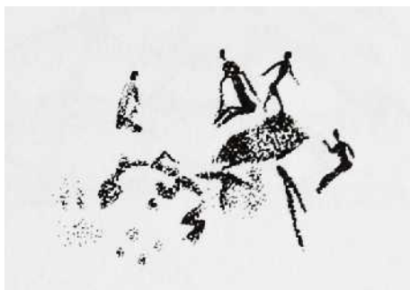
Figure 5. Detail from center right drawing of Nswatugi Cave (Figure 1)