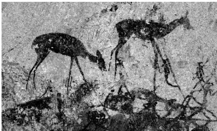
Figure 8. DStretch (RGB0) enhancement of the same area of the panel in Nswatugi as Figure 7. Several hidden figures appear beneath the right-hand duiker. Note also the fine lines above and between the animals.

These two figures (Figures 7 and 8) present a comparison of the drawing of "Nswatugi Cave duiker" (Parry 2000:26) with the DStretch version of the same two animals. As with the previous images, new details are visible. At least two additional standing figures can now be seen, and what seems an amorphous mass below the right-hand duiker is