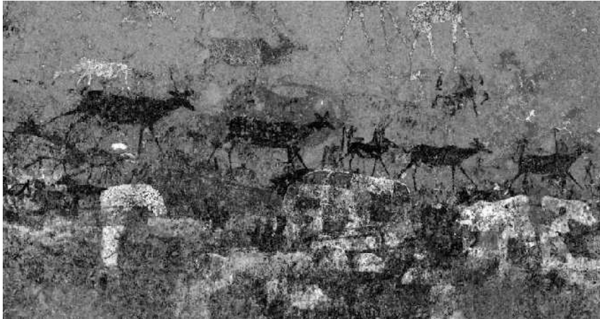
Figure 3. Stoll photo (3438Tif) of same panel in Nswatugi Cave, DStretch CRGB with YELLOW emphasis. The identical image as in Figure 2 is here shown with yellow pigment highlighted, revealing many new details. At least two yellow animals appear, a possible kudu cow with lowered head above the kudu bull on the left side, and a large four-legged composite animal on the right. Additionally, a hook shaped form composed of yellow dots (possibly bees or termites?) is revealed below the kudu bull, as the outline of the forming (center right) emerges (these and other details are strikingly visible in the colour version of this image).