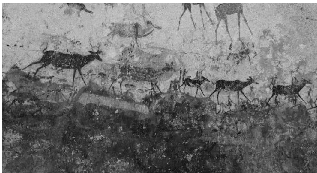
Figure 2. Stoll photo (3438Tif) of the same panel as in Figure 1 in Nswatugi Cave, DStretch CRGB enhanced, followed by Photoshop conversion with RED emphasized.