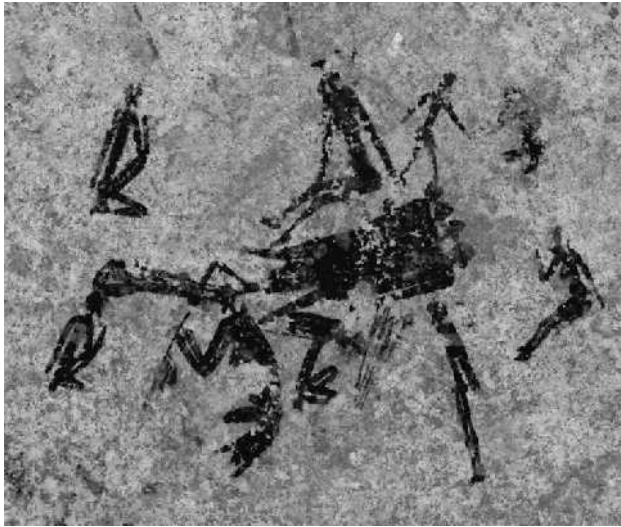
Figure 6. Same area of panel, photographed and enhanced using DStretch.

Figures 5 and 6 show a comparison between a precision drawing and an enhanced digital image of a small group of figures from the main panel at Nswatugi Cave. Many possibly important new details are revealed; the rectangular shape near the center of this group can now be seen as four connected humans, perhaps lying shoulder to shoulder or beneath a single blanket with their heads