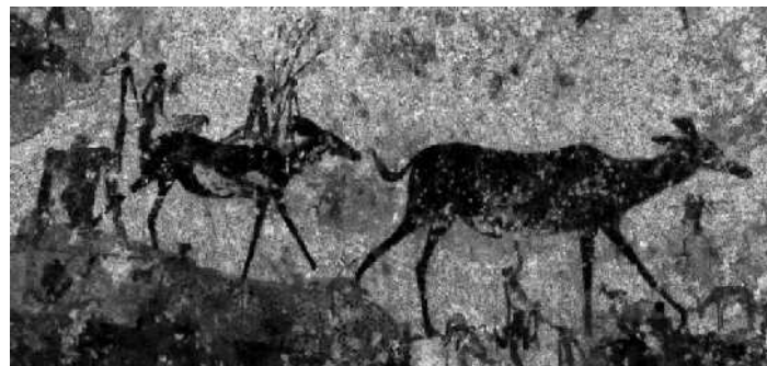
Figure 4. A close-up of the right center area of the panel in Figure 2 enhanced using DStretch CRGB. Close-ups of several portions of this complex panel from Nswatugi Cave are necessary to see these figures. The arm of the figure on the right appears to reach up to touch the belly of the kudu cow. On the left, the figure has two arms, one bent back to touch his face. Might the gestures of these figures have important interpretive meaning?