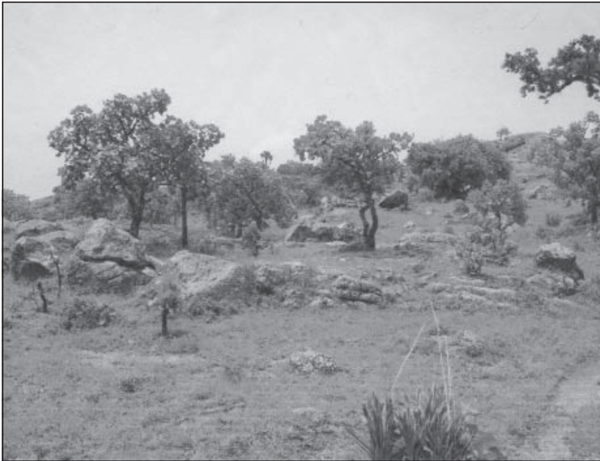
Figure 2: Vegetation on the Shen Hilltop.

the way for thorough archaeological field research. However, we did the limited work we could in April and May 2009, given the tight academic calendar of the University of Ibadan. So far, only a section (the southern part) of the hill complex was surveyed. The exercise enabled us to have some insight into the nature and scope of the material expressions of the Berom of Shen in the Du district of Plateau State, Nigeria. The results (though preliminary in nature) will help us to embark on a full-scale survey coupled with excavations during the dry season. But in the meantime, five main categories of material evidence (aside from pottery) with respect to spatial behaviour have been identified as follows: