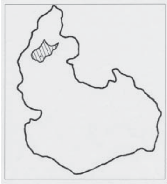
Figure 1: Map of Plateau State showing Jos South Local Government Area (Source: Plateau State Government).