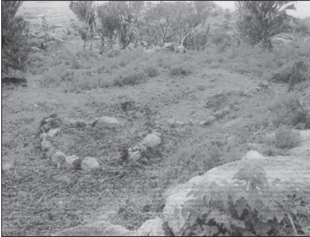
Figure 3: General Overview of a Section of the Shen Hilltop.

Judgements were based on fair hearing in order to ensure that peace reigned supreme in the community.